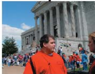
2. Rally against health care cuts at state capitol

Typical CAC activities are shaded CAC Advisory Capacity