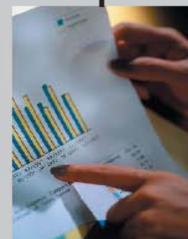
8. Help Develop Five Year Plan