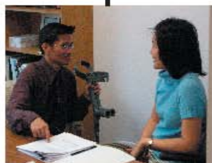
4. "I insist you include this in my person centered plan."