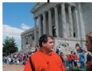
2. Rally against health care cuts at state capitol