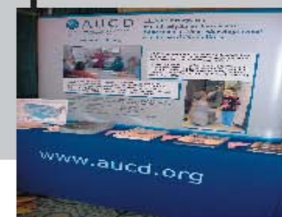
7. EDUCATE the community and legislators about the UCEDD's projects