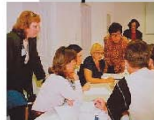
5. "This training would be more parent-friendly if..."