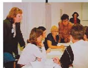
5. "This training would be more parent-friendly if..."