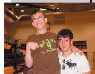
6. "My personal experience helps the UCEDD meet the needs of the community."