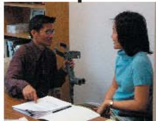
4. "I insist you include this in my person centered plan."