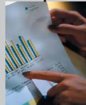
8. Help Develop Five Year Plan