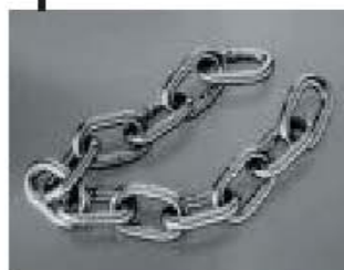
1. Participate in civil disobedience