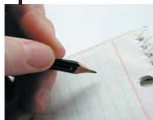
3. ADVOCATE for the needs of PWD's with your legislator